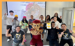
CSU Long Beach